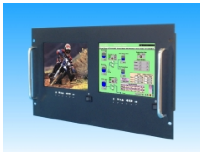
Special Dual 8.4" Rack Mounted LCD with VGA & PAL

Due to a policy of continuous product development KME reserves the right to change specifications and descriptions without prior notification. All trade marks acknowledged. 29lr series 09/2004