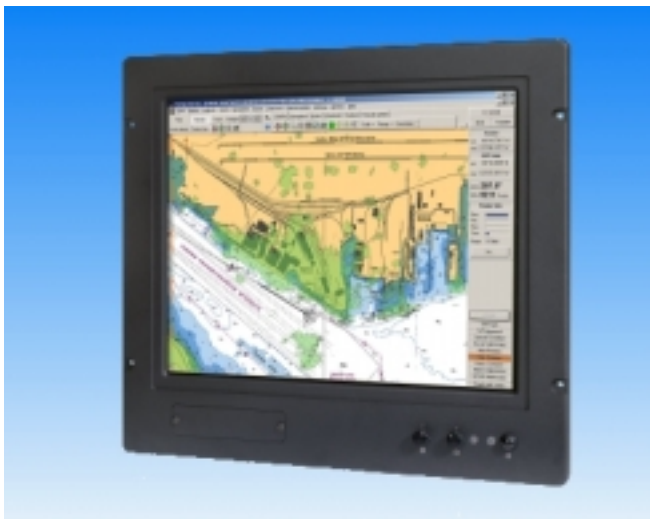
19.0" Marine LCD monitor finished in RAL9011