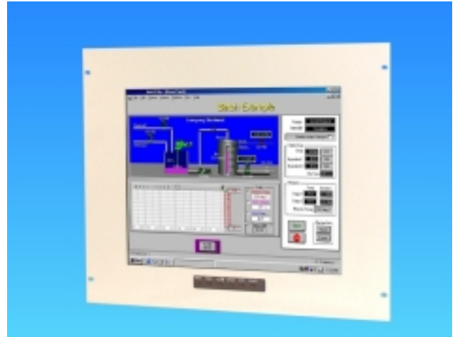
17.0" LCD Rack mount monitor finished in RAL7032

We know that there will be occasions when this standard range is not exactly suited to all customer requirements – and we remain willing to customise colours or dimensions to market demands.