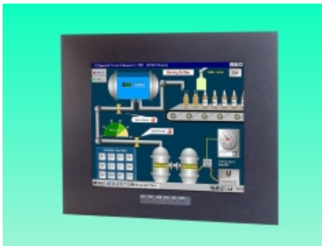
Special 17.0" Panel mount LCD with front controls and finished in RAL9011.

KME has developed a comprehensive range of Panel mountable LCD Monitors for Industrial applications.