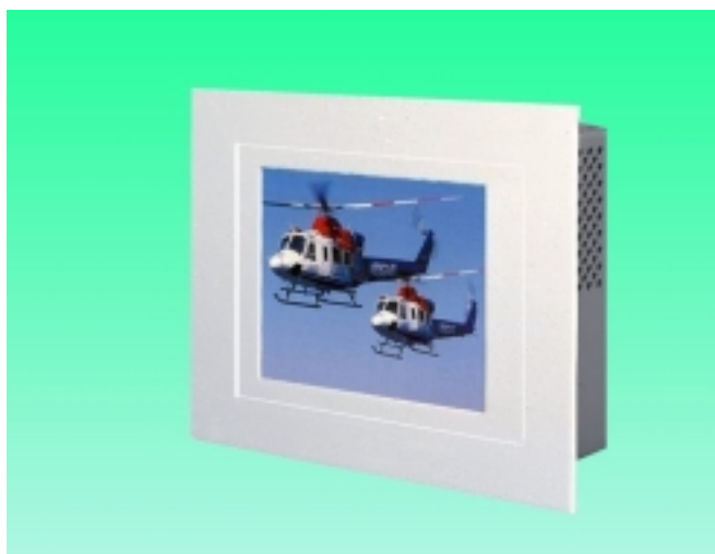
8.4" Panel Mount LCD with VGA/PAL Interface.

We know that there will be occasions when this standard range is not exactly suited to all customer requirements – and we remain willing to customise colours or dimensions to market demands.