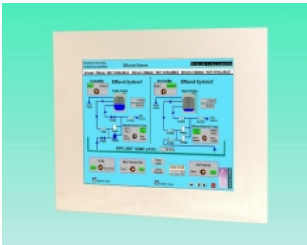
17.0" LCD Panel mount monitor finished in RAL 7032.